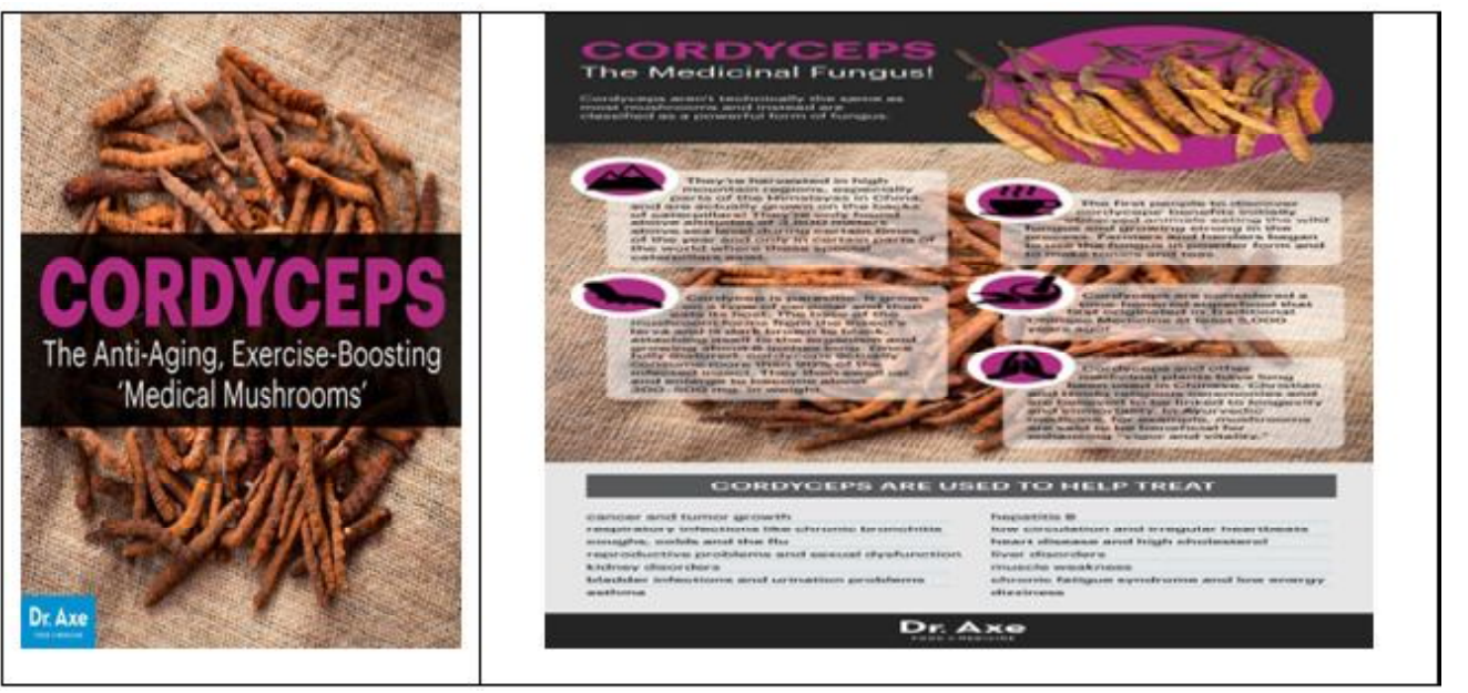
Performance of Anti-Aging & Exercise